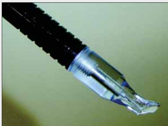
Figure. The G-Probe.